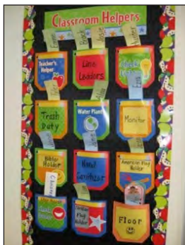
Classroom helper charts