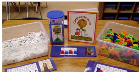
Name picture and letter boards