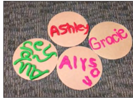
Names with playdough