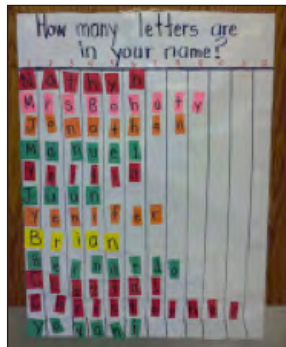
Name study activities