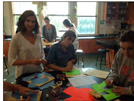
Making "All about me" class puzzles