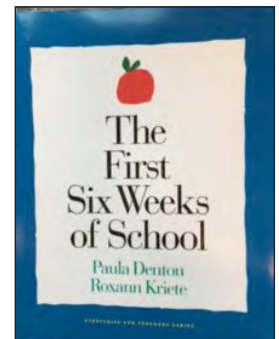
Reference for Content