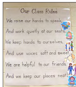
Establishing classroom rules and promises